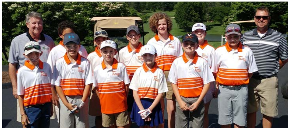
GOOD LUCK! To our PGA Junior League Team who will compete against area club teams this summer.

Golf can be a tough game to learn and to excel in, especially if one has lofty goals regarding the type of player they want to become. It can also be a game of joy and relaxation for those who don't take it too seriously. Just like deciding what to hit into the green, it all depends on your approach.